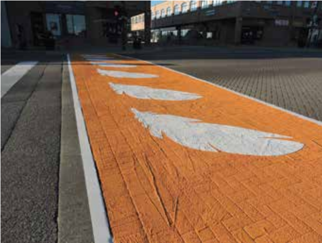
▲ In time for Sept. 30, the first National Day for Truth and Reconciliation, the Town of Orangeville painted an orange crosswalk with seven feathers across it, to commemorate Indigenous children who were forced into residential schools. The seven feathers represent Seven Grandfathers' teachings, which are wisdom, love, respect, bravery, honesty, humility and truth.